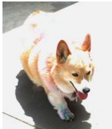
Anvil 1994–2008 He will be missed!

In overview: This past year's Board and committees have devoted many hours of time to improve the Broadmoor - Saddlehill community for your enjoyment and financial well-being. Many of the long overdue improvements and repairs made last year and those coming this year will benefit property values. Hopefully they will also benefit and improve our community spirit. It is in this community spirit that we all need to conduct ourselves with respect for the time and energy these volunteers have contributed on your behalf. A community/neighborhood is far more than the homes and land, it is the people who have chosen to live in an area together. While these people are all necessarily unique, their goals do not have to be. You are encouraged to "get involved" and serve to better our community. Let's work together to improve Broadmoor - Saddlehill both in physical appearance (property values) and community spirit. Together we can accomplish much more than we can alone. We hope to see you at the monthly Board meetings and on our committees.